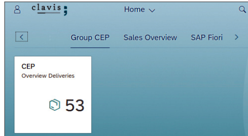
Tile in the Fiori Launchpad